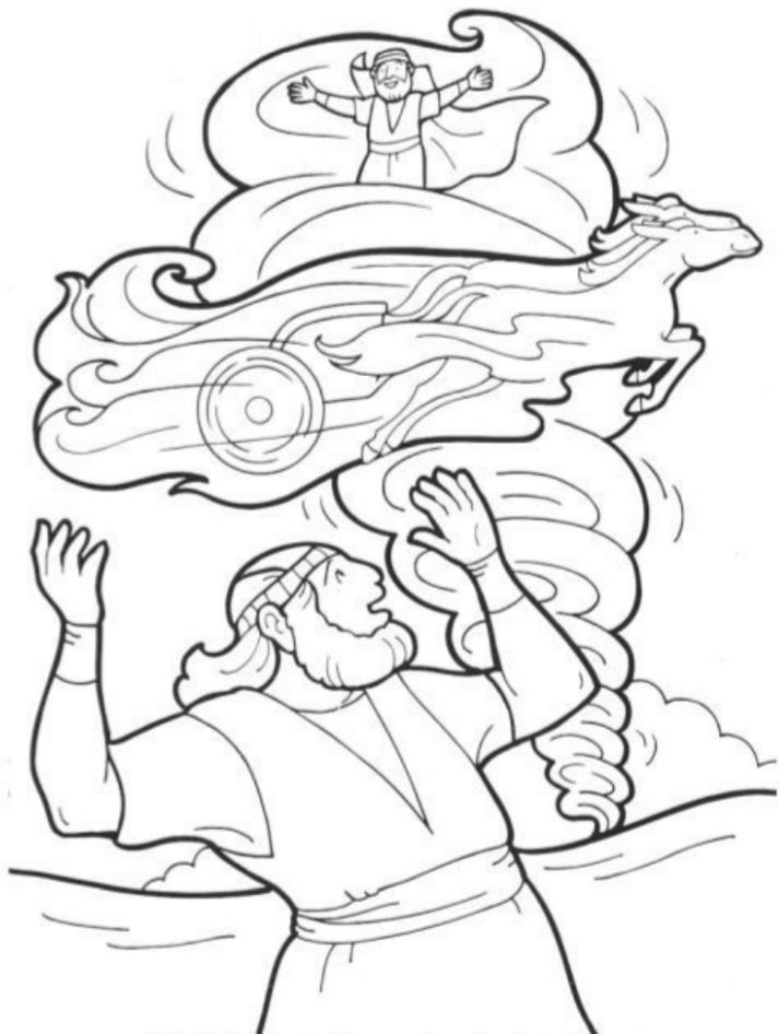
Elijah is taken to heaven in a chariot of fire